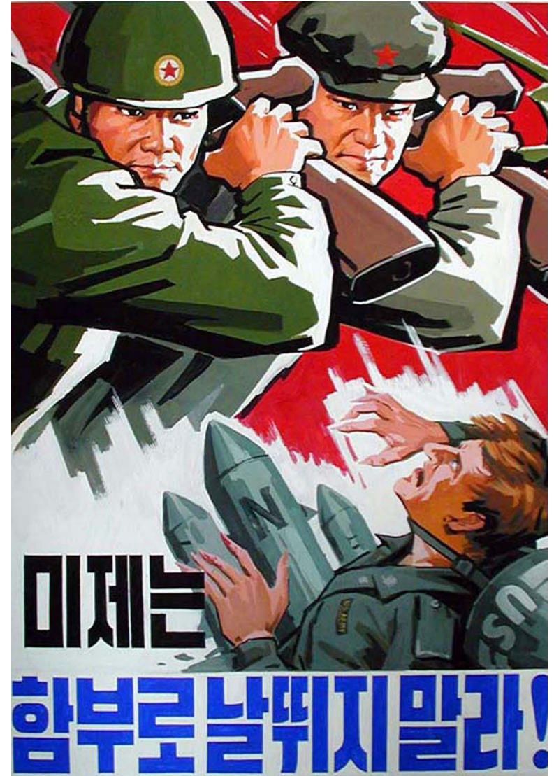
'US imperialists shouldn't carelessly provoke war'

Additionally, since 1976, the U.S. and ROK have held annual joint military exercises, known as Key Resolve and Foal Eagle, which involves the participation of 17,000 US and 300,000 South Korean soldiers, with the deployment of nuclear-capable bombers and aircraft carriers as well as mock land invasions. All this is an indicator to North Korea of an imminent invasion.