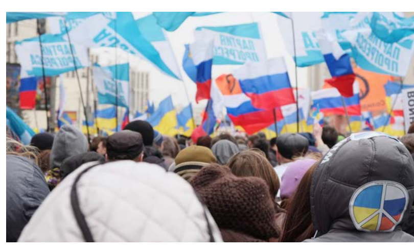
Muscovites protesting the war in Ukraine and Russia's support of separatism in the Crimea on the Circular Boulevards in Moscow on March 15, 2014.

While none of these measures has a high probability of success, any or all of them would prey on the Russian regime's deepest anxieties and might be employed as a deterrent threat to diminish Russia's active disinformation and subversion campaigns abroad.