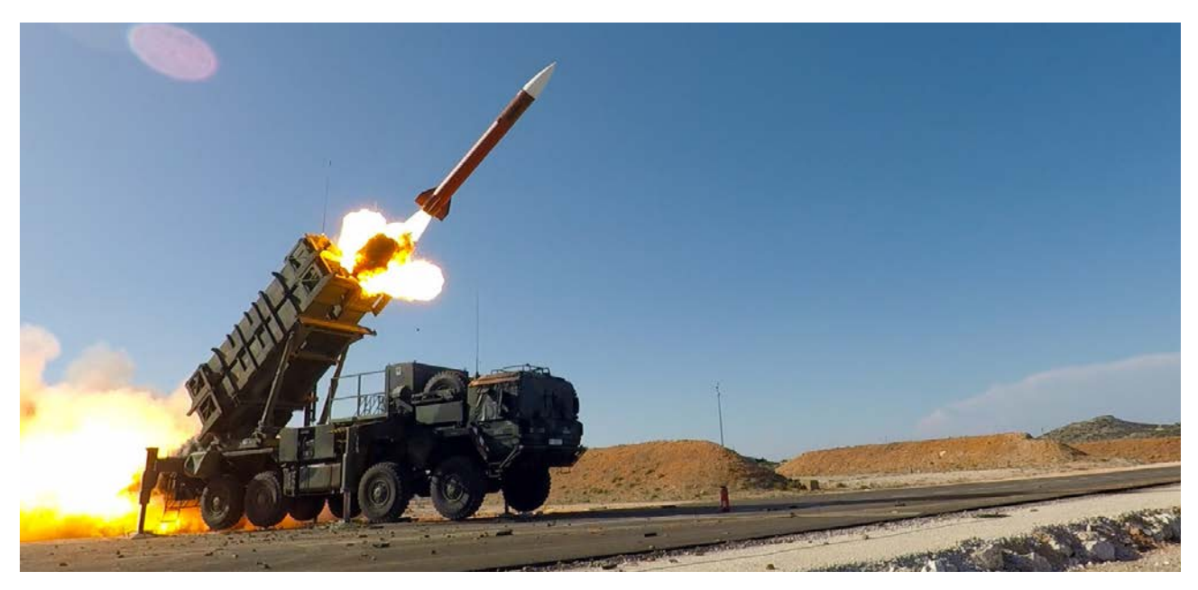
Exercise Artemis Strike was a German-led tactical live-fire exercise with live Patriot and Stinger missiles at the NATO Missile Firing Installation in Chania, Greece, from October 31 to November 9, 2017. More than 200 U.S. soldiers and approximately 650 German airmen participated in the realistic training within a combined construct, exercising the rigors associated with force projection and educating operators on their air missile defense systems.

The task of "extending Russia" need not fall primarily on the Army or even the U.S. armed forces as a whole. Indeed, the most promising ways to extend Russia—those with the highest benefit, the lowest risk, and greatest likelihood of success—likely fall outside the military domain. Russia is not seeking military parity with the United States and, thus, might simply choose not to respond to some U.S. military actions (e.g., shifts in naval presence); other U.S. military actions (e.g., posturing forces closer to Russia) could ultimately prove more costly to the United States than to Russia. Still, our findings have at least three major implications for the Army.