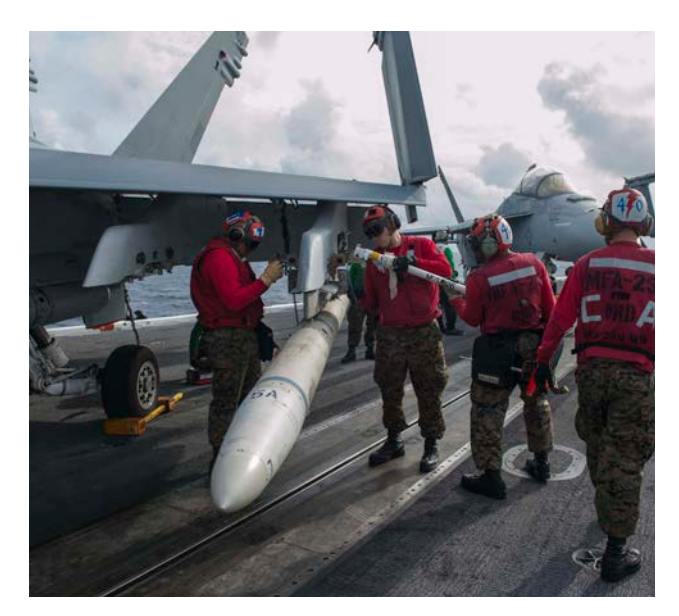
Marines assigned to the Thunderbolts of Marine Fighter Attack Squadron (VMFA) 251 remove a training AGM-88 HARM from an F/A-18C Hornet on the flight deck of the Nimitz -class aircraft carrier USS Theodore Roosevelt (CVN 71).

For example, investing in ballistic missile defense