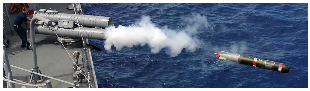
A U.S. sailor aboard the guided missile destroyer USS Mustin (DDG 89) fires a torpedo at a simulated target during Valiant Shield 2014 in the Pacific Ocean September 18, 2014.

Increasing U.S. and allied naval force posture and presence in Russia's operating areas could force Russia to increase its naval investments, diverting investments from potentially more dangerous areas. But the size of investment required to reconstitute a true blue-water naval capability makes it unlikely that Russia could be compelled or enticed to do so.