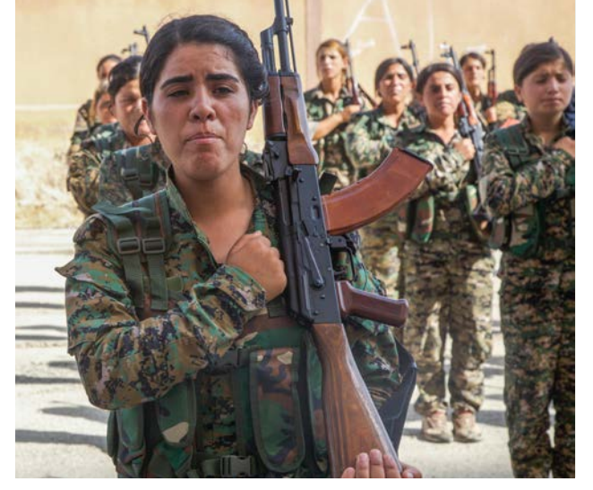
Syrian Democratic Forces trainees, representing an equal number of Arab and Kurdish volunteers, stand in formation at their graduation ceremony in northern Syria, August 9, 2017.

Promoting liberalization in Belarus likely would not succeed and could provoke a strong Russian response, one that would result in a general deterioration of the security environment in Europe and a setback for U.S. policy.