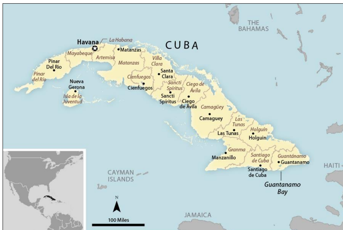
Figure I. Provincial Map of Cuba

Since 2019, the Trump Administration has significantly expanded U.S. economic sanctions on Cuba by reimposing many restrictions eased under the Obama Administration and imposing a series of strong sanctions designed to pressure the government on its human rights record and for its support for the Nicolás Maduro government in Venezuela. These actions have included allowing lawsuits against those trafficking in property confiscated by the Cuban government, tightening restrictions on U.S. travel and remittances to Cuba, and engaging in efforts to stop Venezuelan oil exports to Cuba.