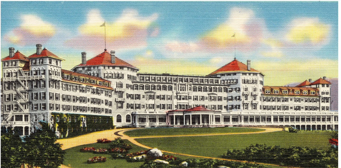
The Mount Washington, Bretton Woods, White Mountains, N.H.