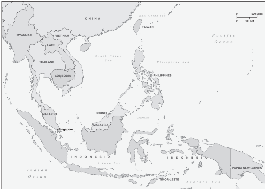
Figure 2.1. Map of South East Asia

relations with China. 23 As part of this policy, India upgraded its status from a ‘sectoral partner’ of ASEAN in 1992 to a ‘strategic partner’ in 2012. 24 India has signed defence-related bilateral agreements with various South East Asian states: Indonesia in 2001 and 2005, 25 Viet Nam in 2009, and the Philippines and Thailand in 2012. 26 However, these agreements were often in the nature of a general memorandum of understanding, and have not resulted in much more than military visits and exchanges, limited common exercises and naval patrols. 27