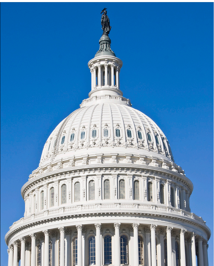
Capital Dome Washington DC

potentially, then make contributions to members of Congress that meet with Taiwan's foreign agents, but we are unable to attribute those contributions to any of the firms mentioned here. This data also only reflects direct campaign contributions made from these agents to members of Congress and does not reflect other fundraising activities like bundling, which allow lobbyists to solicit contributions for candidates from friends, family, or literally anyone else.