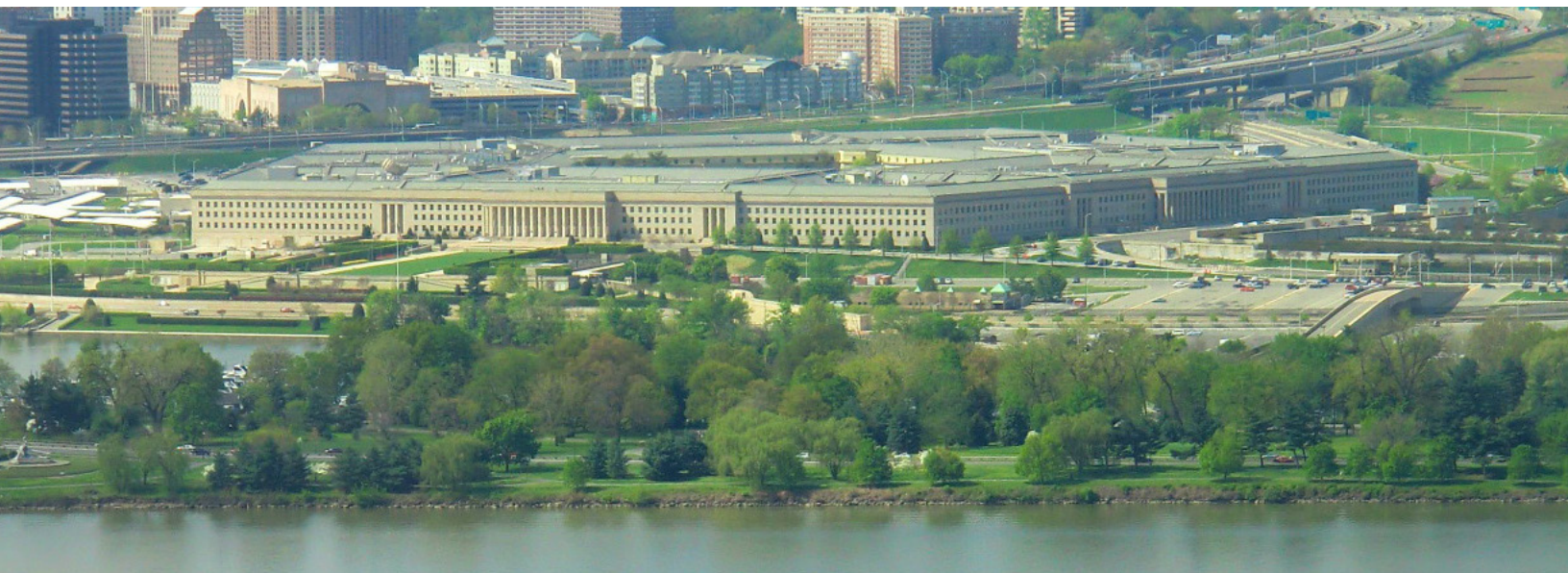
A view of the Pentagon from the Potomac River

While most of the firms working for Taiwan were fairly transparent in reporting the work they had done, Global Vision Communications was less forthcoming. In working on behalf of the Taiwan Civil Government the firm reported just two contacts, covering the periods between “October 31, 2019-March 31, 2019” and “March 31, 2019-September 30, 2019” indicating that the firm chose to lump its various political activities into two broad entries. 57 The description for both these activities is listed as, “Public relations services listed above in an effort to promote the Taiwan Civil Government’s efforts to achieve self-determination for the people of Taiwan and forge closer relations with the U.S..” 58 Needless to say, this is an extremely broad description and these three month date ranges offer the public little opportunity to evaluate the work they are doing on behalf of Taiwan.