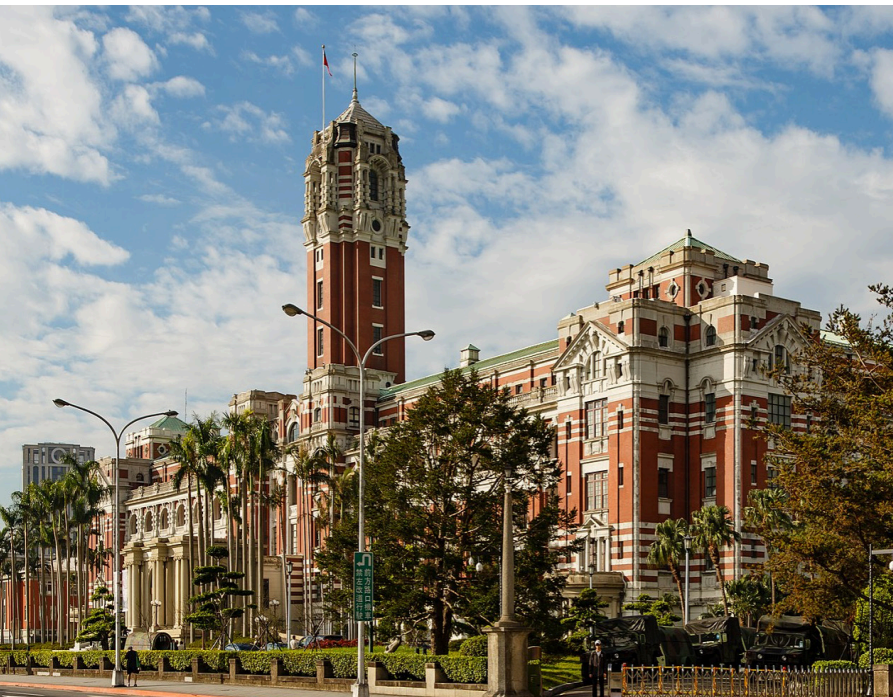
Taiwanese Presidential Office Building Taipei, Taiwan

Congress, Gephardt served as both the House Majority Leader and the Minority Leader.