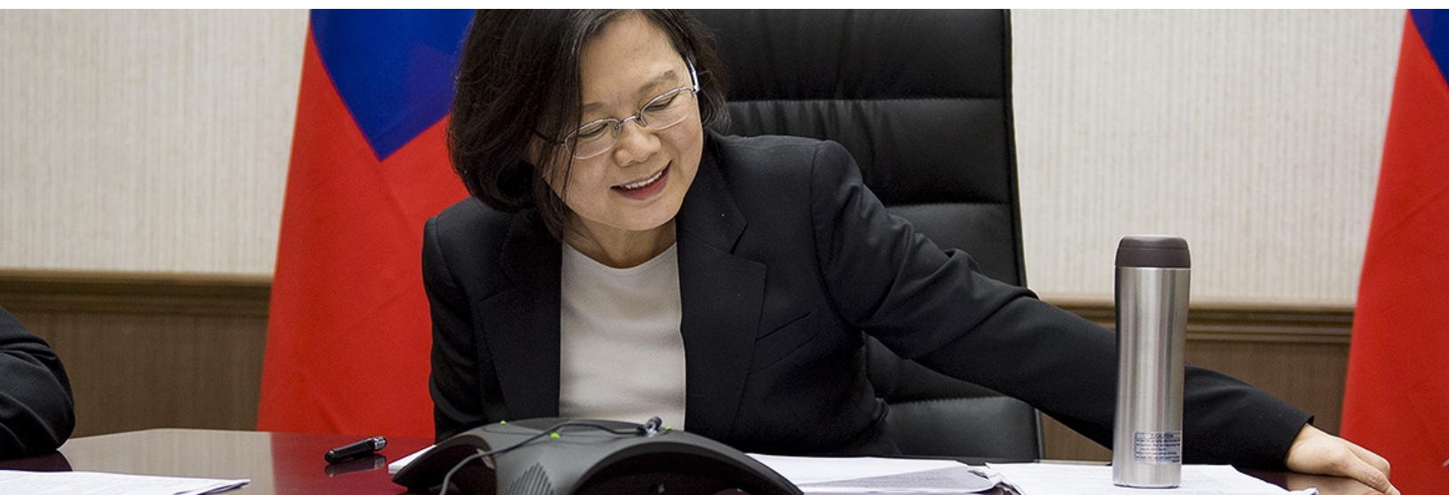
President Tsai speaks by phone with US President-elect Donald J. Trump, 2016