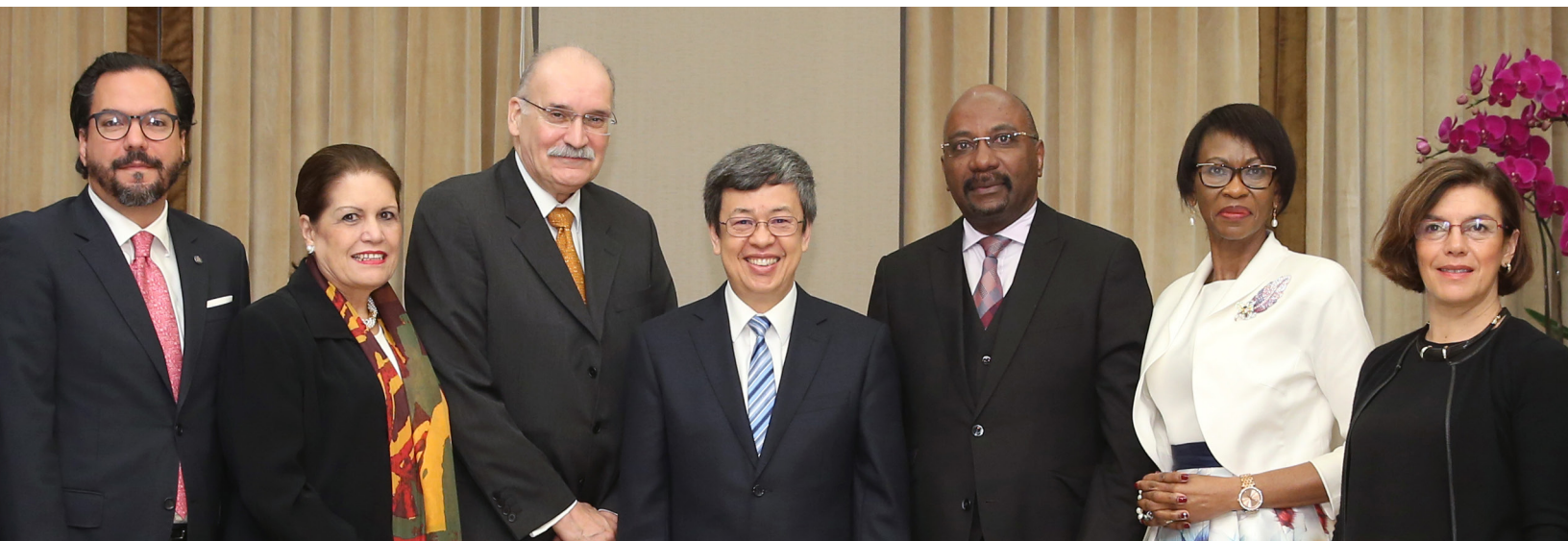
Former Taiwanese Vice President Chen meets with United Nations Representatives

ency and enforcement of FARA so that the public can be aware of and equipped to assess how the U.S. government is influenced by outside interests.