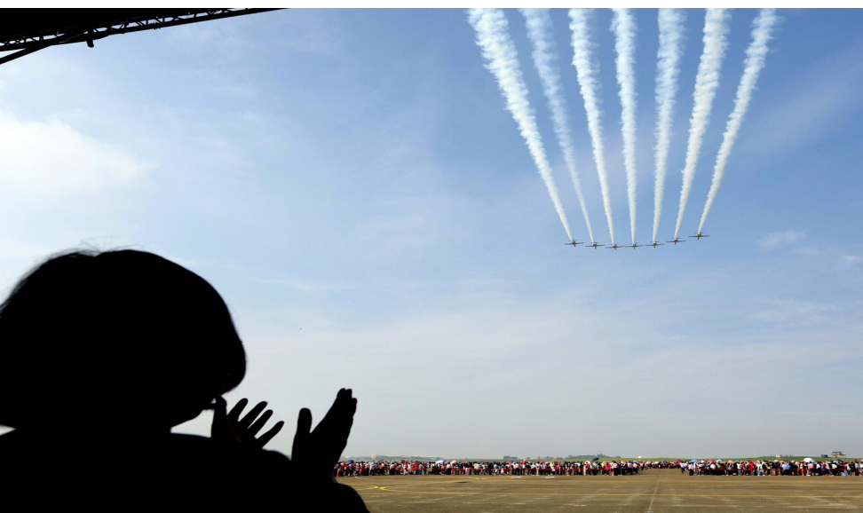
President Tsai Ing-wen attending a military demonstration

of the Taiwan Relations Act in a press release on April 4, 2019. 41 In the press release, Risch is quoted as saying, “In the 40 years since the Taiwan Relations Act was signed into law, the U.S. and Taiwan have enjoyed a strong relationship rooted in our common values, as well