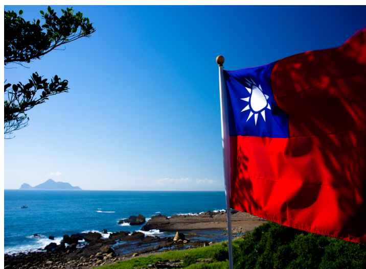
The Taiwanese Flag flies over Turtle Island

Taiwan and the U.S. enjoy a complex, and in many ways, asymmetrical, relationship. Though the U.S. does not support Taiwan's independence, the U.S. and Taiwan maintain a comprehensive unofficial relationship marked by trade and defense commitments. 3 The economic relationship, supported by the U.S.-Taiwan Trade and Investment Framework, makes the U.S. Taiwan's second largest trading partner, second only to the People's Republic of China. Meanwhile, Taiwan is the U.S.' ninth largest trading partner. 4